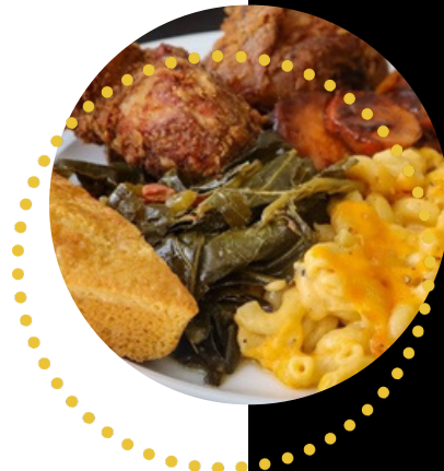
PLATED MEAL MENU