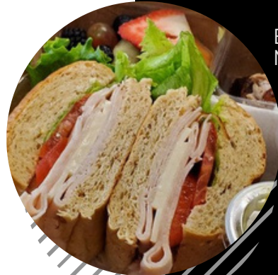
BOX LUNCH MENU